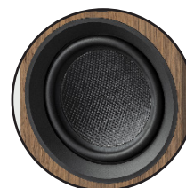
Fiber glass carbon composite woofer